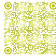
Application Continuation Form